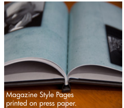
Magazine Style Pages printed on press paper.