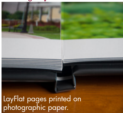
LayFlat pages printed on photographic paper.